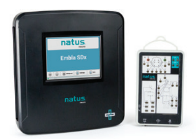
Standard sleep testing with Embla SDx