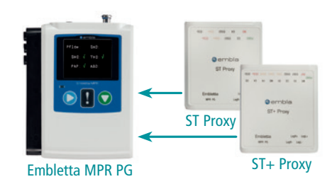
Now integrated with Embletta MPR Scalable Sleep System

To learn more about Natus products, contact your local distributor or sales representative.